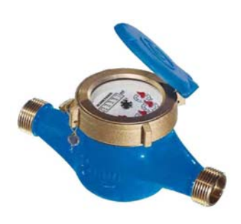
B-METER GMDX - MULTI JET WOLTMANN WATER FLOW METER