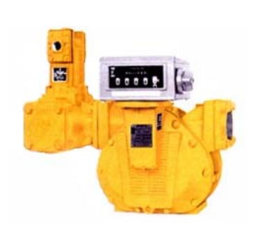
LIQUID CONTROLS (LC) POSITIVE LIQUID DISPLACEMENT ROTARY WITH PUMP, MOTOR, HOSEPIPE FUEL FLOW MET AND NOZZLE