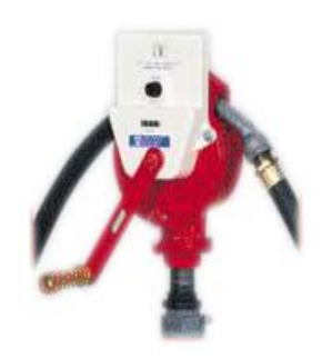
FILL-RITE HAND DRIVEN FUEL TRANSFER PUMPS