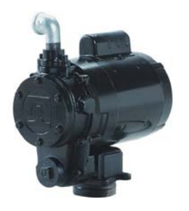
FILL-RITE LUBE OIL TRANSFER PUMP