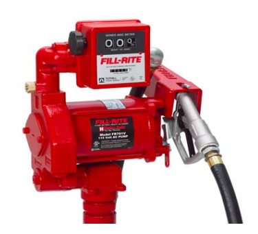
FILL-RITE AC FUEL TRANSFER PUMPS