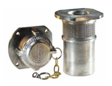
DIP TUBE MANDREL