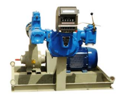
TOTAL CONTROL SYSTEMS (TCS) FLOW METER WITH PUMP AND MOTOR