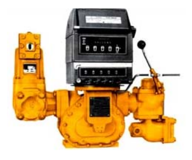
LIQUID CONTROLS (LC) POSITIVE CONTROLS (LC) FLOW METER DISPLACEMENT ROTARY FUEL FLOW METER

Deals in all types of Oil-Field Equipments Gasoline Pumps – Dispensers – Petroleum Hose Pipes – Flow Meters – Filters – Nozzles – Pumps and Electric Motors.