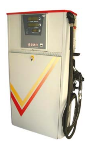
MIDCO ELECTRONIC FUEL DISPENSING PUMP