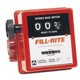
FR-807 FILL- RITE FUEL FLOW METER