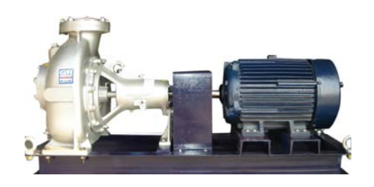
GORMAN RUPP SELF PRIMING CENTRIFUGAL PUMP WITH MOTOR