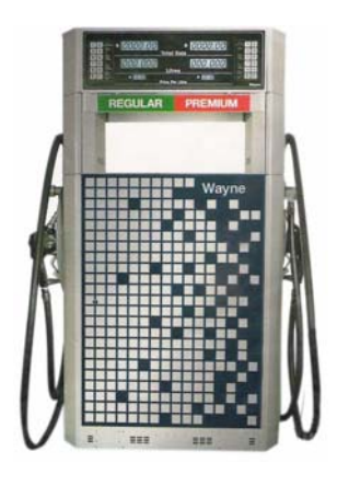
DRESSER WAYNE ELECTRONIC FUEL DISPENSING PUMP