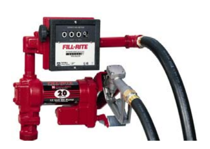
FILL-RITE DC FUEL TRANSFER PUMPS