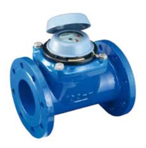
B-METER WDEK-30 WOLTMANN WATER FLOW METER