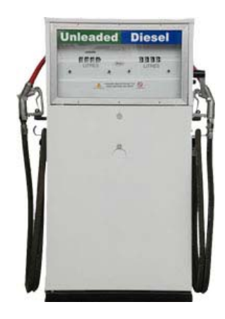
MIDCO MECHANICAL FUEL DISPENSING PUMP WITH HAND DRIVE MECHANISM