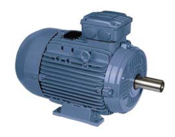
WEG EX-PLOSION PROOF ELECTRIC MOTOR