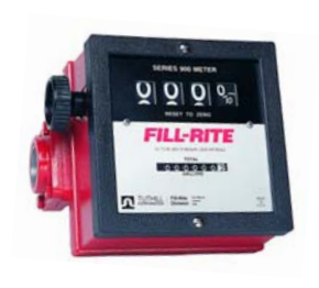
FR-901 FILL-RITE FUEL FLOW METER